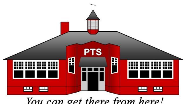
You can get there from here!